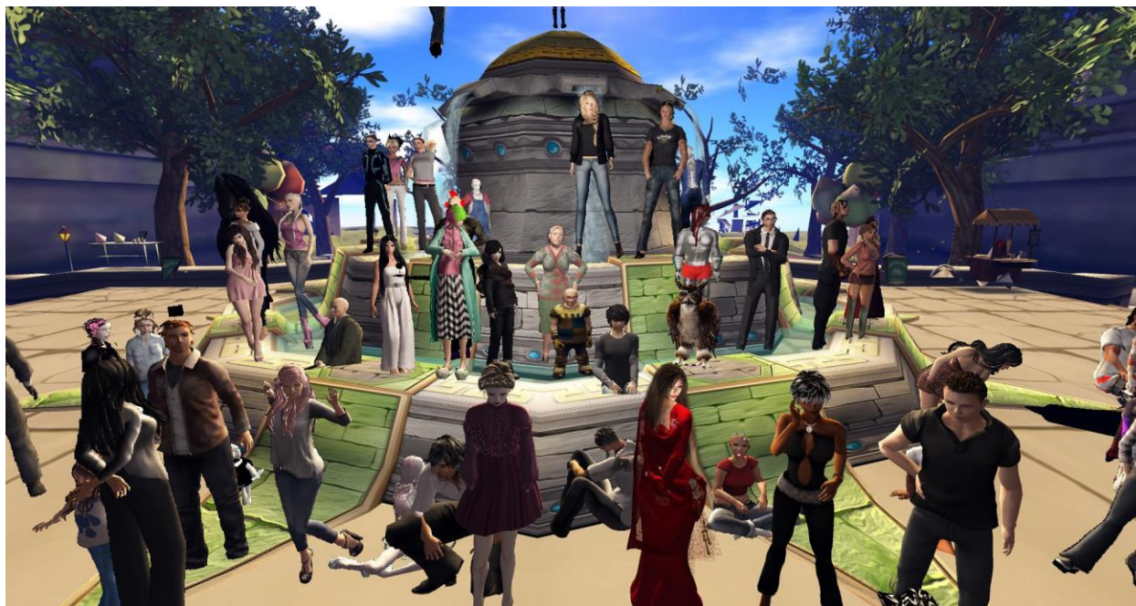
Figure 2. A group of language learners' avatars posing for a selfie and self-introductions in the target language

Finally, Service-Learning Project 4 – Becoming members of academic communities of academic literacy practice – effectively utilizes technology to solve language teaching and learning issues in Indonesia. The teacher candidate focused his service-learning project on aiding language learners to become members of academic communities of academic literacy practices (Lave & Wenger, 1981).