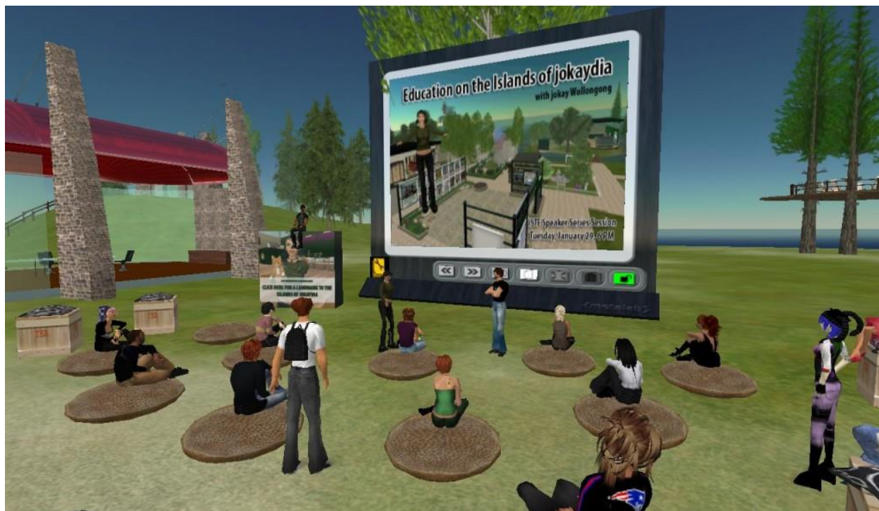
Figure 1. An example of a language learning classroom setting recreated in Second Life

In Service-Learning Project 3 – Building bridges across digital and socio-economic divides for low income foreign language learners with digital literacies in Second Life – the project provided the potential to create simulated target language spaces that offer the same or similar stimuli as real-world immersion to language learners who do not have the financial means to afford to study abroad. An idea of what this looks like is represented in Figure 1 below.